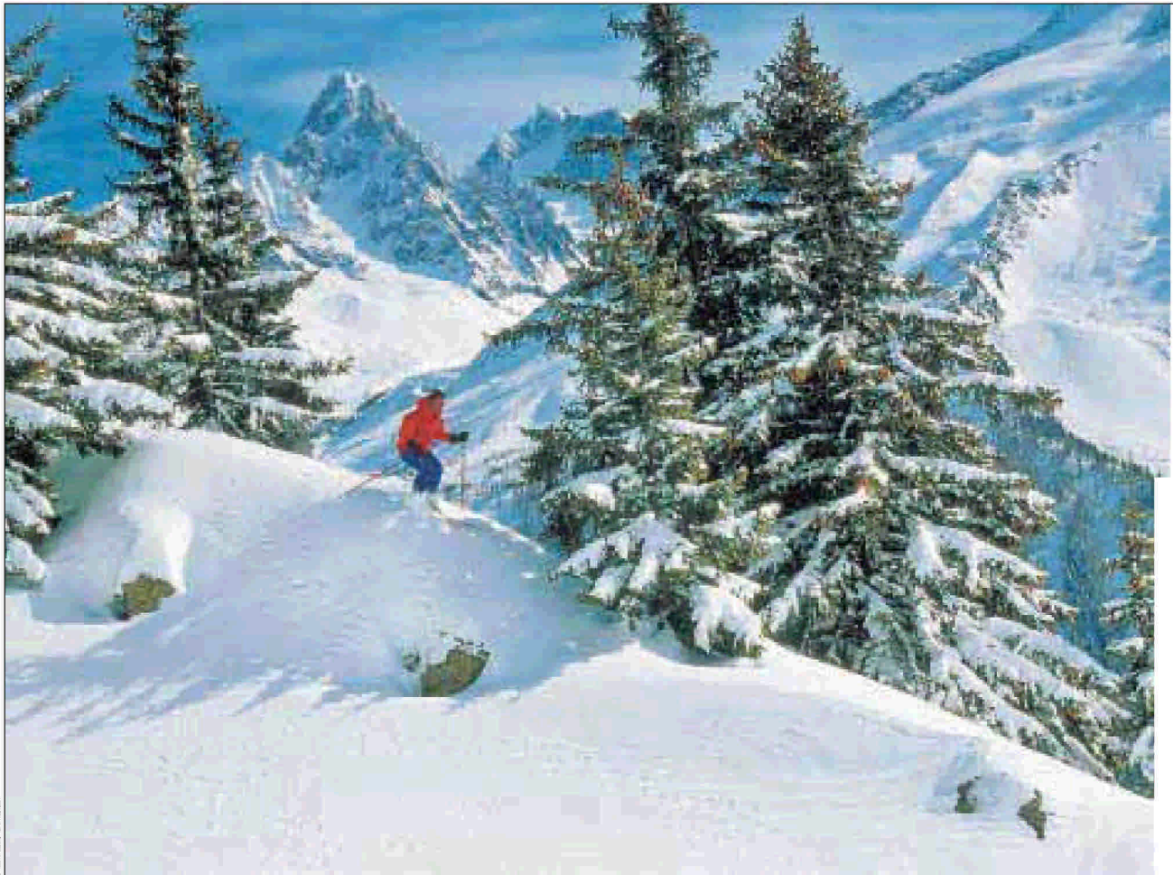
Blue sky jinking: Crozet offers easy access to 50km of lift-served runs and is also a favourite with families